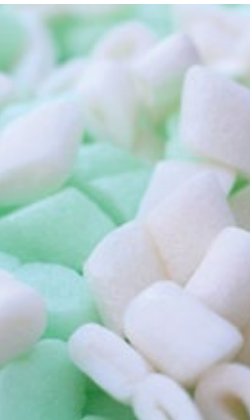
Bioplastics FernUniversität in Hagen