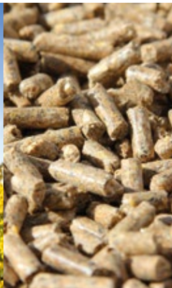
Bioenergy (Power and Heat) OVGU Magdeburg