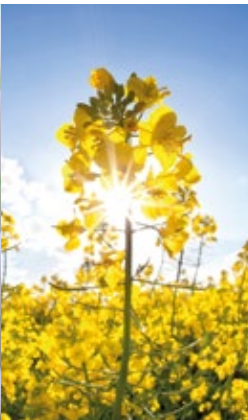
Biofuels FernUniversität in Hagen